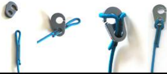
Brummel hook attachment to speedbar lines

To rig the speed system, first disconnect the Brummel hooks connected to speed bar lines as detailed below: